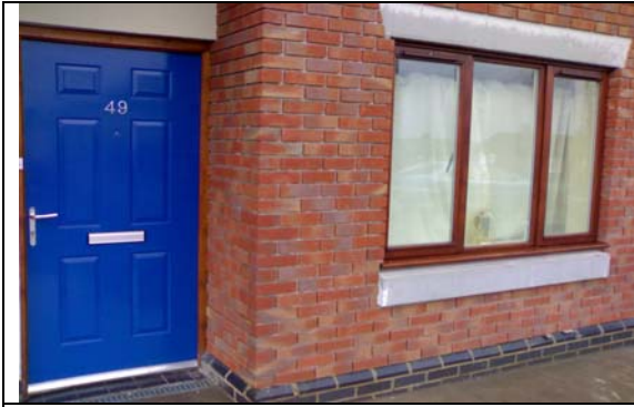
Sheltered housing bungalows in County Durham built using ICF (Beco).