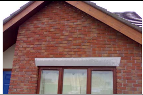
Brick slips are 7429HL from the Celina Klinker range from Padipa Ltd. Ardex adhesive used. All work undertaken by contractor.