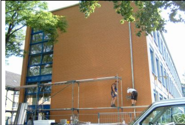
A four storey block of flats in Stuttgart, Germany undergoing full renovation. Work undertaken by R. Heumer GmbH of Heiden .

In these examples of renovations, up to 100mm of insulation has been applied externally. This has the advantages that the house/flat must not be vacated while the work is being done, rooms are not reduced in size and is the work is less fiddly.