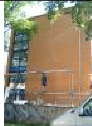
Exterior insulation applied and then clad with brick slips from the Celina Klinker range. All fixing materials from Ceresit – insulating board, reinforcing mortar, reinforcing mesh, adhesive and pointing mortar.

All these materials are also supplied by Padipa Ltd.